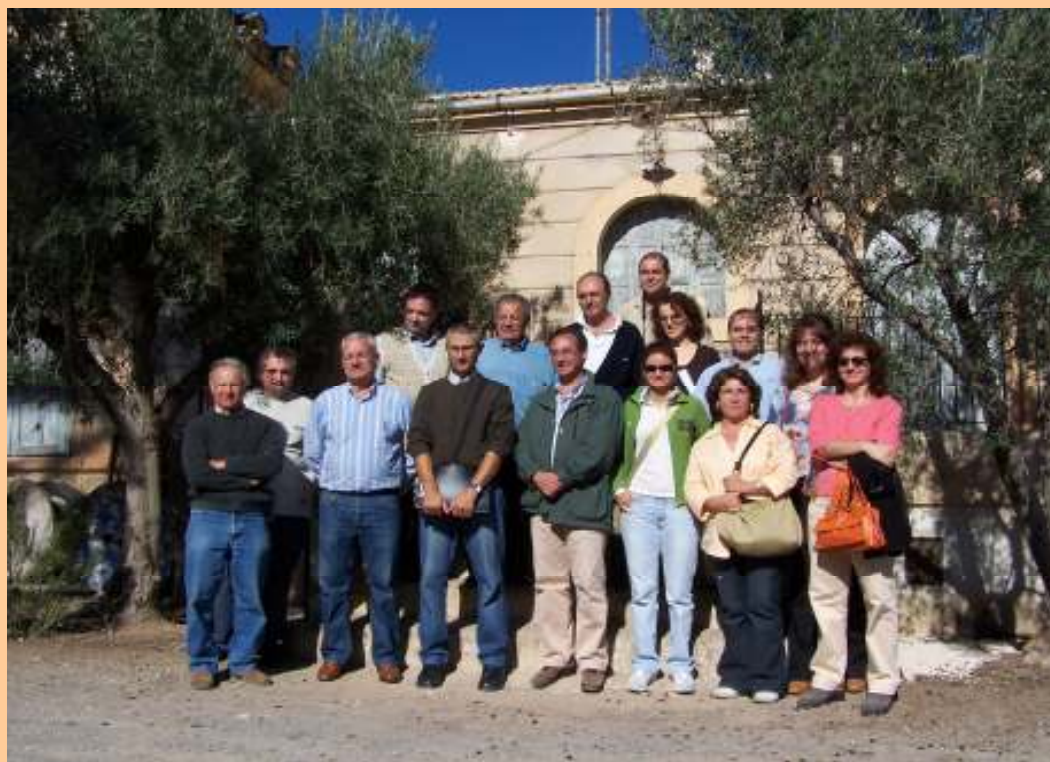
Part of the visitors group, formed mainly by local school and college teachers