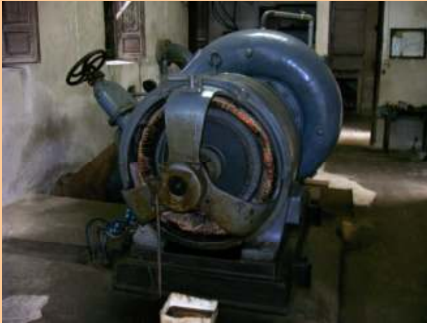
Machinery from the 1930's still at work in Sivaes Pumping Station